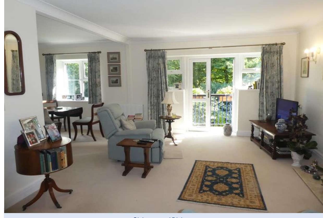
Sitting room / Dining area

For viewings please contact the Scheme Manager on 01737 222394 or Fifty5plus on 01488 668655